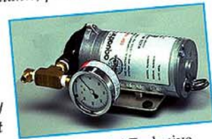
Aquathin's® Exclusive Optional "Zero Noise Platinum Booster Pump".

THE PLATINUM 90 subsink system contains Aquathin's unique patented process of Reverse Osmosis, Deionization, and Granular Activated Carbon and combines it with AQUATHIN'S revolutionary patented Electronic Intelligent Memory Panel (EMP) for automatic maintenance. The benefit is prolonged efficiency by removing the necessity of a manual flushing. The Aquathin® PLATINUM 90 Subsink unit is the most compact system on the market. It is easily installed and can be attached to your icemaker. The Aquathin® RO-DI system produces "salt-free" water for daily use. This unit removes salt, heavy metals, chemical pollutants, pesticides, and disease causing water borne micro-organisms. Comes complete with revolutionary state of the art features surpassing any other water treatment devices.