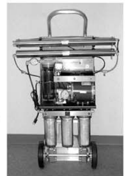
Portable 400 GPD with tank for onsite demonstration.